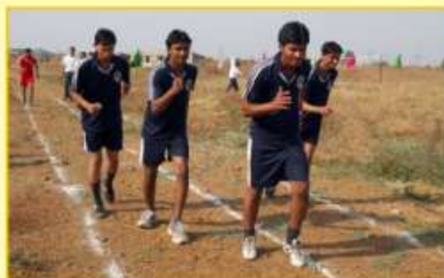
"Racing Competition" @ SSCET