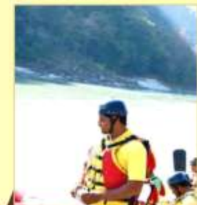
SSCET Adventourous Camp at Hrishikesh