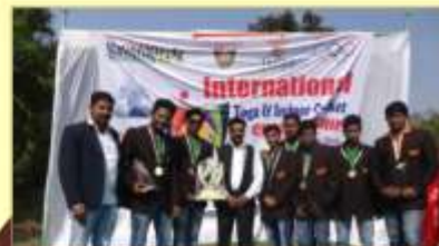
India Beat Bangladesh In International Indoor Cricket Tournament