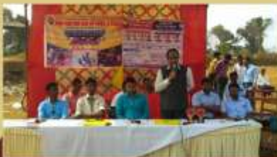
SSCET Promotes Cordial Sports Across The Region