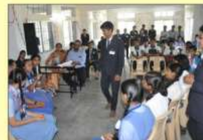
Students From Shri Maharshi VidyaMandir, St. Michael, St. Annes, Carmel Academy, LTV, Shinde College and many more participating in Aavishkar 2k15 at SSCET