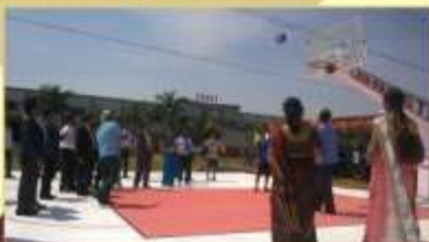
Inauguration of Newly Made Basket Ball Ground at Aavishkar 2k15