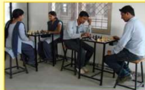
"Sports Week" @ SSCET