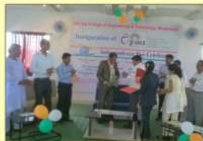
EPLANTS Club inaugurated at SSCET