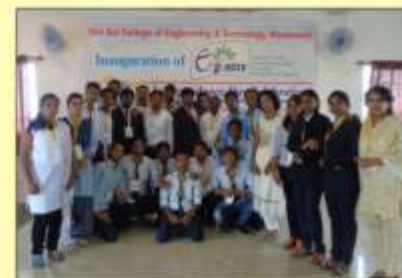
Members of EPLANTS CLUB