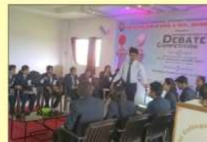
Inter - Departmental Debate Competition at SSCET