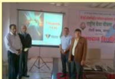
Organ Donation talk organised at SSCET