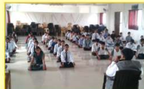
Regular Yoga & Meditation for Staff & Students @ SSCET