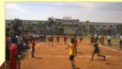
Sports For School & Jr. Colleges at Aavishkar 2k15