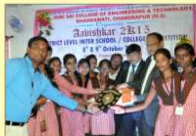
School Students receiving Trophy and Cash Prize at Aavishkar 2k15 at SSCET