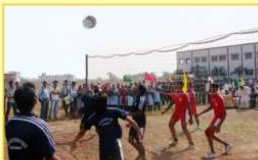
"Volleyball Competition" @ SSCET