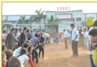
Sports at Aavishkar 2k15 at SSCET