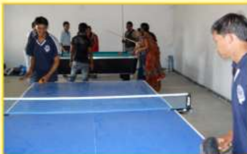
"Sports Week" @ SSCET