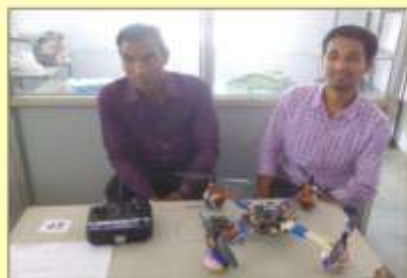
Electronics Deptt. Students of SSCET participated in National Level Project Competition