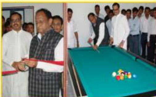
"Indoor Sports Inauguration" @ SSCET

College has a Sport department that offer a variety of sports for students. As playing sports is one of the favorite activities. Apart from being a fun activity, sports offer several health benefits, thus contributing to one's physical and mental well-being. Sports play a vital role in the enhancement of one's personality by being a source of exercise and entertainment. It develops leadership qualities and fosters a team spirit in students.