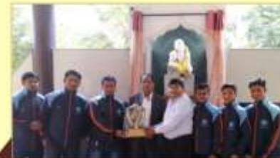
Players of SSCET Participated In International Indoor Cricket Tournament, Emerged as Champion