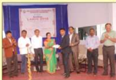
Honorable Parents felicitating Meritorious Students and University Toppers of SSCET at Annual Gathering Lamhe 2k16